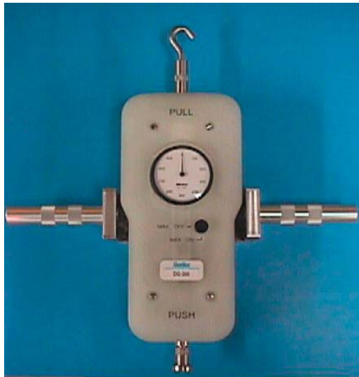
DG Series force gauge shown with optional Handle Set Assembly (p/n SPK-DG-Handle).